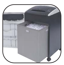
Easy to empty large cabinet style bin with pull out waste basket