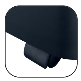
Castors increase mobility