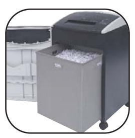
Easy to empty large cabinet style bin with pull out waste basket