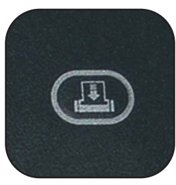
Turbo jam release button clears jams quickly & easily